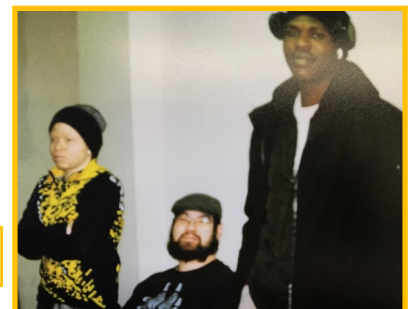
Security detail at the Beef Supper .

Interested in joining our prayer team? Call one of our members for information.