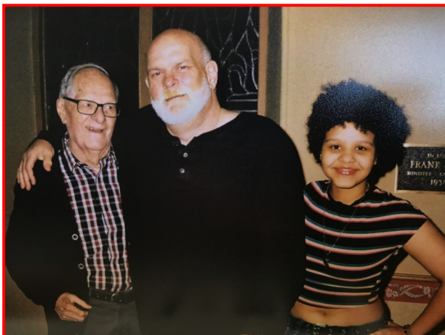
Three generations of the Pott's family.