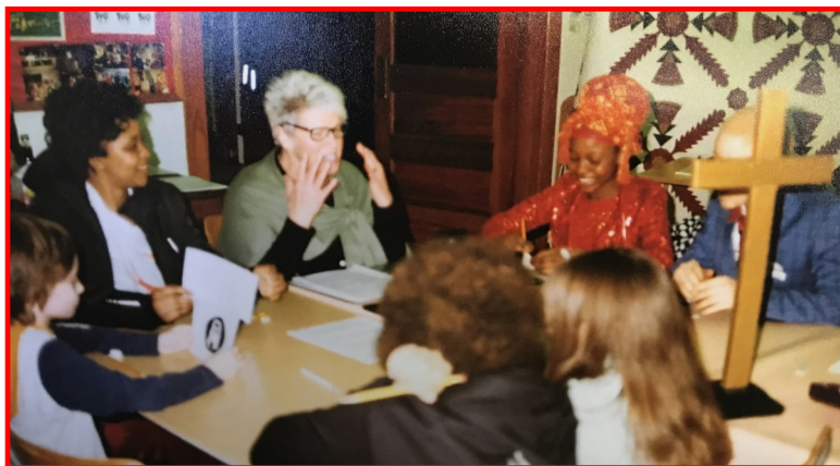
SKA group photos.

*Address labels must be removed. Thank you.